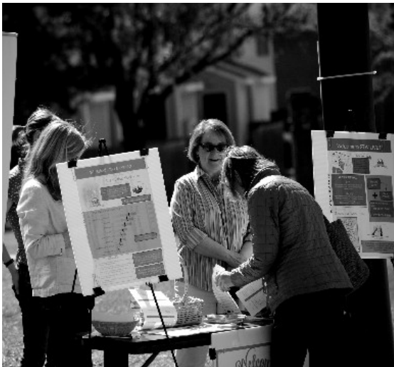
CA-MPO Engagement Plan Charlottesville Albemarle Metropolitan Planning Organization